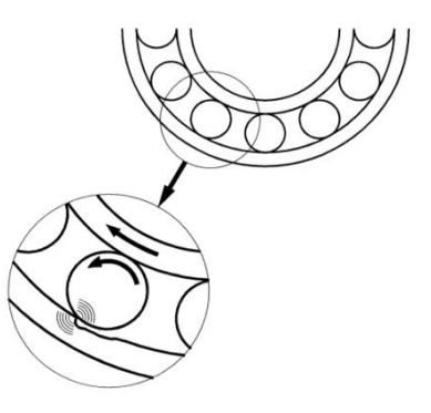
Figure 1.A defect in the outer race Causes a shock impulse to spread through the bearing components and machine structure.

Both amplitude modulation due to modulating forces (geometric faults) and an increase in random stationary forces caused by frictional changes (lubrication